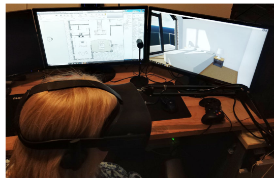
Fig. 6 Participant making changes within the VR

documents and identifies a gap within the industry for which the present paper suggests a solution. The development strategy describes the proposed prototype and explains the reasons behind the choice to develop this specific prototype, as well as the implications it may have on an architect's design choices. Existing products with similar features are also explored here.