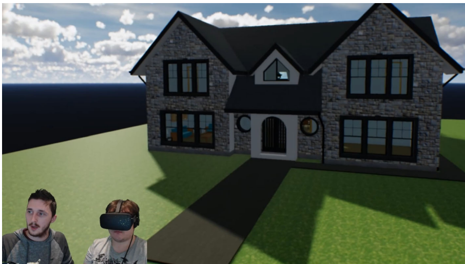
Fig. 2 Revit model immersed in VR

The goal of this research is to utilize existing technology in an original manner to achieve desirable outcomes; therefore, this paper is more practical rather than hypothetical in nature. This work details the ins and outs of the B/Q